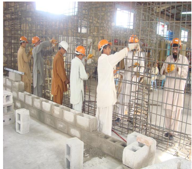
CTTC construction trades vocational training programs.

House# 555, Opposite old UN Compound, East Shirpoor Square, 1003, Kabul, Afghanistan