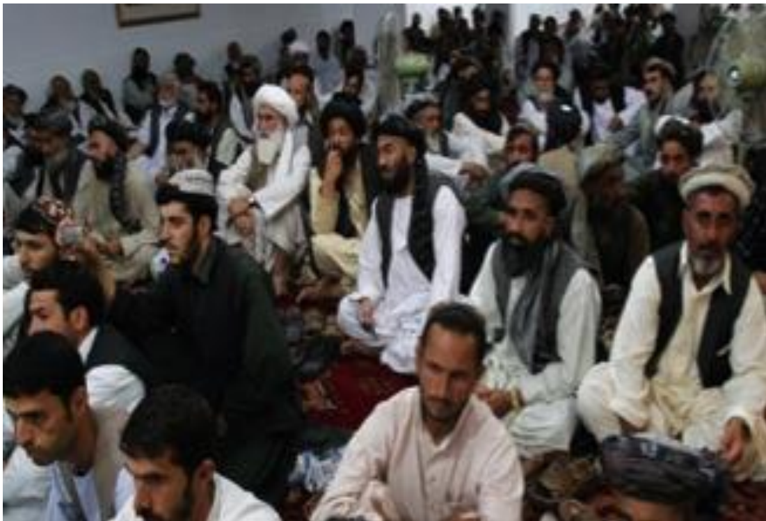
Community stabilization programs includes working with local community Shuras.

Community Stabilization; The CTTC collaborated with the US Army in the design and implementation of the US and British funded “National Detainee Programs” for incarcerated Taliban, including vocational career guidance and vocational training programs conducted at the US Bagram Air Base in Afghanistan and believes that efforts at national integration are vital to the interest of a unified peace in Afghanistan. The CTTC’s broad experience in the design and implementation of community stabilization programs also includes the implementation of the “Afghan Peace and Reintegration Program” (APRP) developed by Afghan leaders in Farayab, the US military, the CTTC and included identifying and conducting vital training programs for unemployed locals and “At Risk” youth and ultimately placing almost 300 out of the 450 beneficiaries into skilled jobs. For the efforts implementing a community outreach program for the Combined Joint Task Force/E (USDOD) and USAID in Nangahar, Kunnar and Khost which identified “At Risk” youth, provided them with vocational and technical training and placed them into skilled jobs, the CTTC was presented with two awards of merit from the then Commanding General of ISAF, “General Karl Eikenberry.”