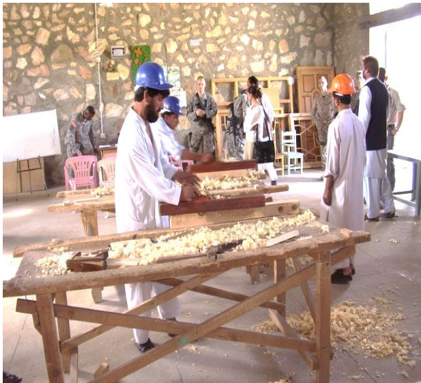
CTTC construction trades vocational training programs.

Training; The CTTC also operates an award winning vocational and technical training center in Jalalabad, Nangarhar providing both gender and non-gender training programs in the construction trades including carpentry, plumbing, electrical, masonry, painting and steelwork. Technical programs implemented for USAID, USACE and the Nangarhar PRT include total station survey, Auto Cad, USACE “Construction Quality Management (CQM) and site engineering classes. The CTTC has also conducted World Bank funded Disaster Risk Management (DRM) training programs, training Afghan ministry engineers and staff to become qualified DRM trainers and ultimately train their respective Community Development Councils (CDCs) on how to incorporate DRM into local community development projects. As an incentive to trainees, the CTTC also maintains a job placement center networking with both private and public sector employers in order to place newly graduated CTTC trainees in skilled jobs.