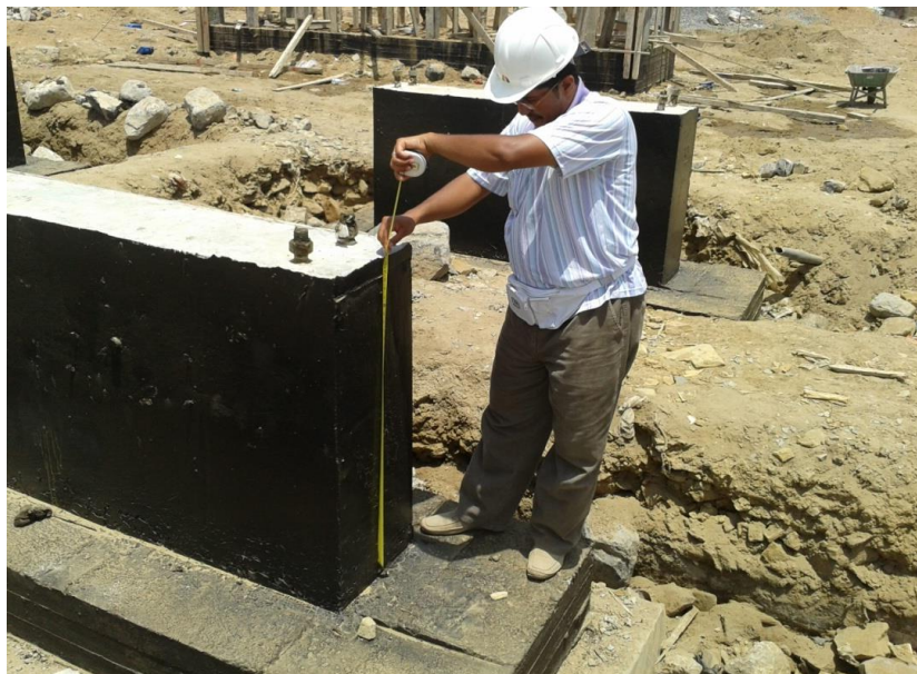
CTTC Engineers monitor infrastructure across Afghanistan

Third Party Monitoring (TPM); Within the scope of the TPM programs competitively awarded to the CTTC, qualified and experienced national and expatriate staff collect, verify, catalogue, map and report on both infrastructure, social and program assets funded by international donors. The CTTC also surveys affected citizens and reports on how these projects impact their and their neighbor's lives. In some cases, project costs – budgeted and actual - are also collected allowing unit comparisons between provinces, contractors and ministries. Using this information, The CTTC also makes recommendations to the donors and ministries on ways to improve the implementation of current and future development projects.