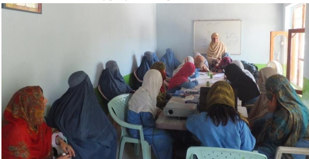
Gender focused training programs.

Women Empowerment Programs; he CTTC’s mission for women and girls is to reduce poverty, empower women and encourage their active participation in the economic, educational and health sectors in Afghanistan through viable Small and Medium Enterprises (SMEs) trainings, vocational and technical training programs and health training programs. As well the CTTC has implemented a large inventory of gender focused programs and believes that gender enhancement contributes directly to national unification and ultimately a more peaceful Afghanistan. The CTTC also actively works to place female graduates in skilled positions by networking with other Afghan agencies and NGOs to help ensure that each female CTTC graduate achieves her professional goals and aspirations. Follow up interviews are conducted monthly with female CTTC graduates and their respective employers to check up on employment status and ascertain if the graduate was properly trained or not and make modifications in the training program if require.